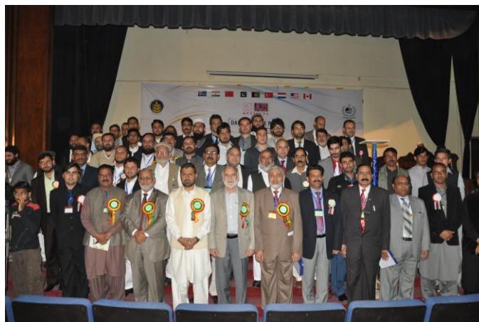
Senior Minister Khyber Pakhtunkhwa Mr Inayatullah Khan chaired the inaugural session of DSP 2015