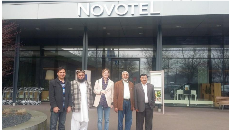
DSP team explored collaboration in the Netherlands and attended third One Health Congress