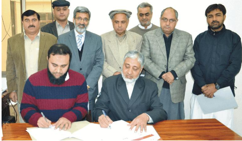
خیبرمیڈیکل اور زرعی یونیورسٹی کے مابین تعاون کی یادداشت پر دستخط کئے جا رہے ہیں DSP and KMU entering into collaboration in Biorisk Management through an MoU