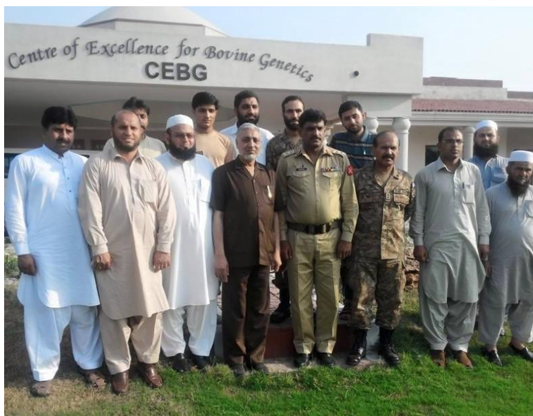
DSP and CEBG agreed on utilization of elite dairy and beef semen for commercial farmers in KP ad FATA