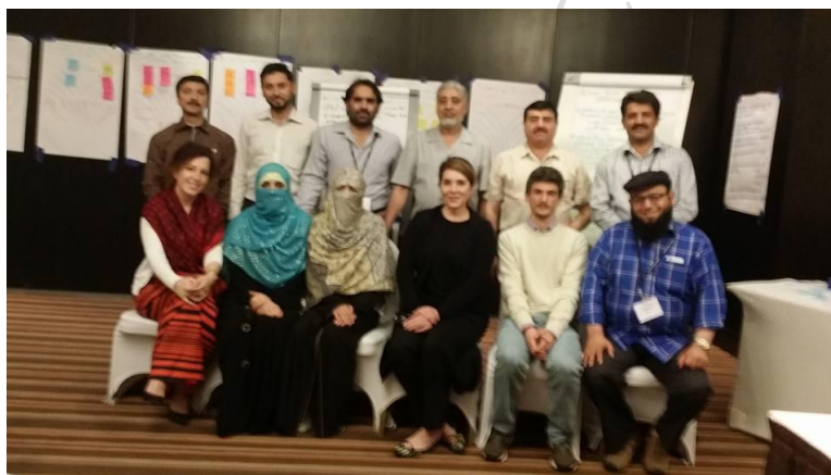
DSP-SNL Biorisk Management Curriculum Development Workshop at Dubai, May 21-26, 2016