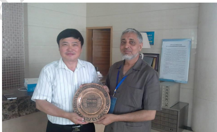
DSP signed Letter of Intent with Chinese Academy of Agric Sciences