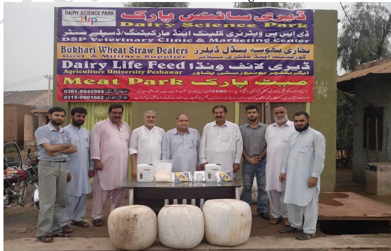
DSP established Vet Clinic and Marketing Center under Meat Park